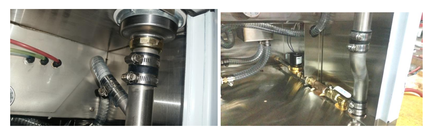
Drain hose connection to drain pipe