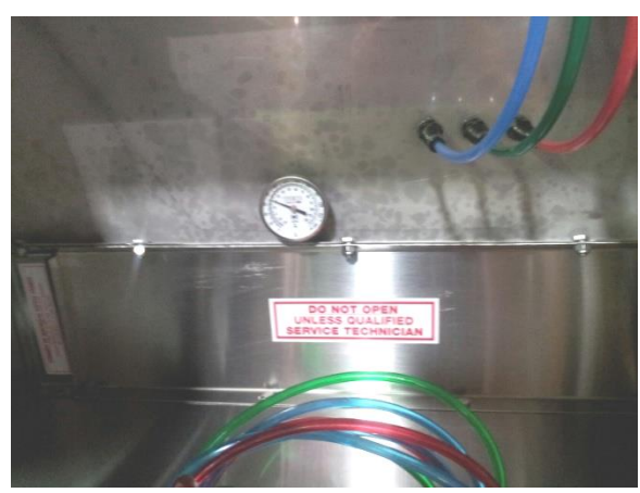
Showing chemical lines and temp gauge in cabinet