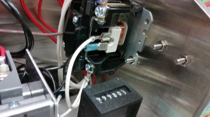
Wash motor contactor next to rack counter

THE SUSTAINER HEATER— is rated 350 Watts at 120v, and will draw approximately 3 amps. It is not designed to provide operational heat; the operational hot water must be provided by the building's primary water heater. The sustainer heater is not designed to provide a rise to incoming water temperature. Its purpose is to sustain the existing hot water sitting in the pan of the machine if it were to sit idle. The sustainer's snapaction thermostat receives power any time the machine is switched on. Electrical equipment should have the power turned off when the machine is left unattended.