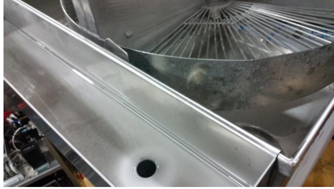
Outer tray to dump glasses, carousel Copyright ADS Installation ASQ II, Rev 1.0 11/16/2017

10) Verify that chemical feed lines are in their proper container and that lines are primed. Prime switches are located on side of the control box and labeled.