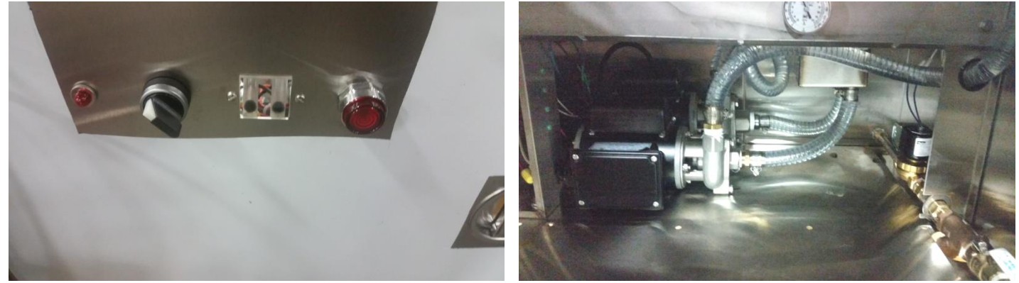
Cycle light, master switch, chemical sight window, red start switch

Do not rotate the carousel while machine is in cycle. Doing so could result in serious bodily injury from spraying hot water and chemicals.