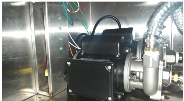
Wash pump is placed behind the rinse pump shown here