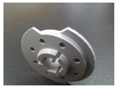
Cams showing lower notch