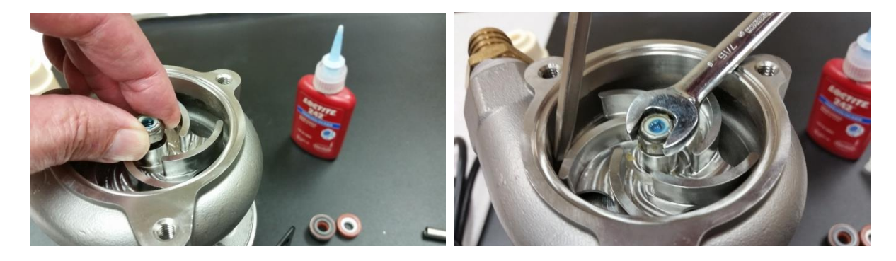
Place one drop of Loctite on shaft threads. Brace impeller with a screwdriver and fasten locknut 098-2507 to hold impeller securely to the motor.