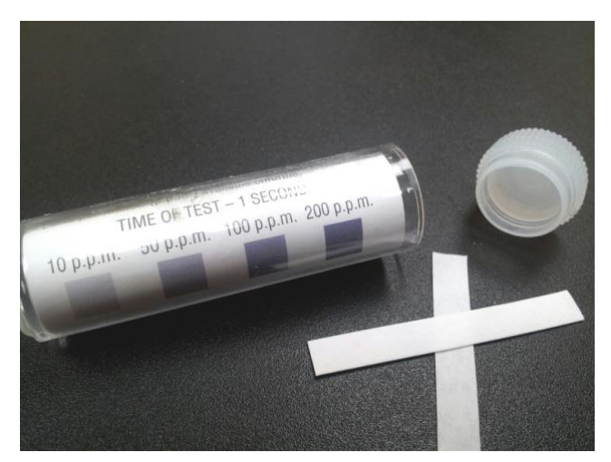
Chlorine test strips for measuring sanitizer

ADS provides three (3) peristaltic pumps to dispense liquid chemicals Chemical feed lines are color coded "Red" Detergent, "Green" Sanitizer, "Blue" Rinse-aid Pick-up tubes are provided for chemical product containers Sanitizer (chlorine) concentrations shall be set at 50 parts per million Inspect the transfer tubing for any cuts or holes, keep them protected and secured out of the way