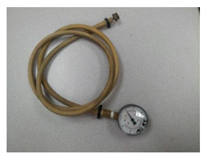
Spray arm pressure tester #088-

To lengthen out the notch (length = time energized) or close the length of the notch, use the timer adjustment tool, which is provided and taped to the control box shelf. This tool has two raised buttons that fit into the holes on the side of each wheel. The factory sets the start of each function using the right-side wheel of the cam. TO ADJUST rotate only the left-side cam wheel. The left-side of the wheel controls the point when that specific functions ends. Factory settings are only initial settings, adjustments will be required for each chemical as well as the water fill time because water pressures will be different for every account.