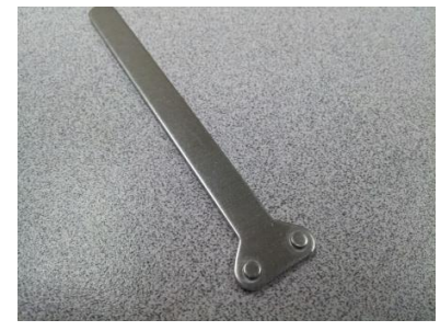
Cam timer adjustment tool 1048

Timer for the ASQ is a 7-cam. The cycle times are not adjustable. The cams of the timer are wheels whose positions are either fixed or adjustable on its hub. Each cam controls a specific machine function, as noted on the timer decal. Adjustable cams are comprised of two wheels held together at the hub. The perimeter of each wheel is divided into 180-degrees of high cam and 180-degrees of low cam. When one of these wheels is rotated on the hub in relation to the opposing wheel, the two lower cam segments can form a notch in the perimeter (see photo below right). Above each cam is a timer switch with a metal finger that rides along the outer edge of the cam. When the finger drops into the lower cam notch, the function of that cam starts.