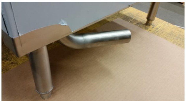
1.5" OD Drain line exits on the right hand side of cabinet