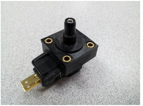
Optional Chemical Alarm switch, barb with adjusting screw

AUDIBLE LOW CHEMICAL ALARM OPTION—The optional chemical alarm (P/N 031-0326) uses a pressure switch with a barb fitting that extends from the control box and connects to the chemical line by means of a "T" fitting. The switch sends voltage to a buzzer located in the control box. Sensitivity is adjusted by an Allen wrench (5/64" or 2mm) to turn a screw located in the center of the barb (see photo above). Remove the tube from the barb; turn the screw to the right for less sensitivity. Chemical must be placed on the floor of the cabinet for the pressure switch to work.