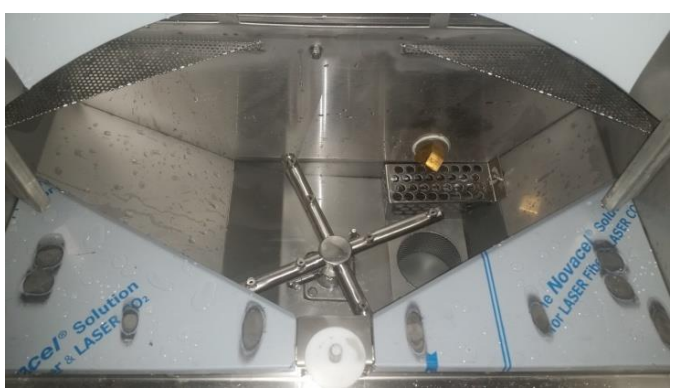
ASQ tank spray arm