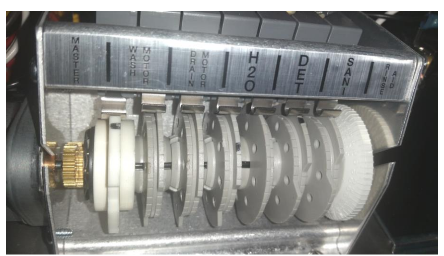
ASQ cam timer, fixed cams are MASTER, WASH MOTOR and DRAIN MOTOR

To lengthen out the notch (length = time energized) or close the length of the notch, use the timer adjustment tool, which is provided and taped to the control box shelf. This tool has two raised buttons that fit into the holes on the side of each wheel. The factory sets the start of each function using the right-side wheel of the cam. TO ADJUST rotate only the left-side cam wheel. The left-side of the wheel controls the point when that specific functions ends. Factory settings are only initial settings, adjustments will be required for each chemical as well as the water fill time because water pressures will be different for every account.