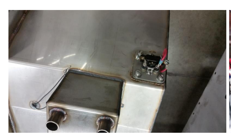
Showing bottom of tank, float wire, sump, heater attached