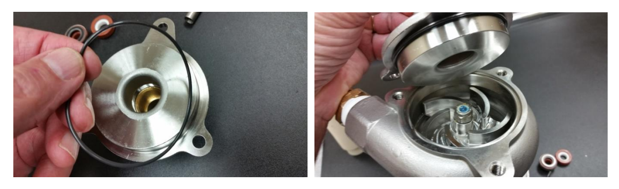
Place O-ring gasket 089-6311 on the pump cover and place into the pump housing