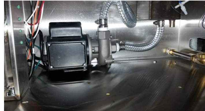
Wash pump with rinse pump removed