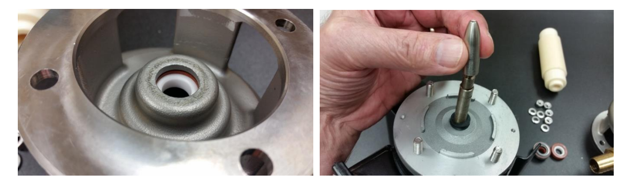
Turn the housing over, check that seal and boot are fully seated in housing, place protective shield over the threads on the motor shaft.