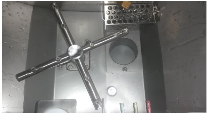
Wash tank with spray arm, float, secondary scrap screen