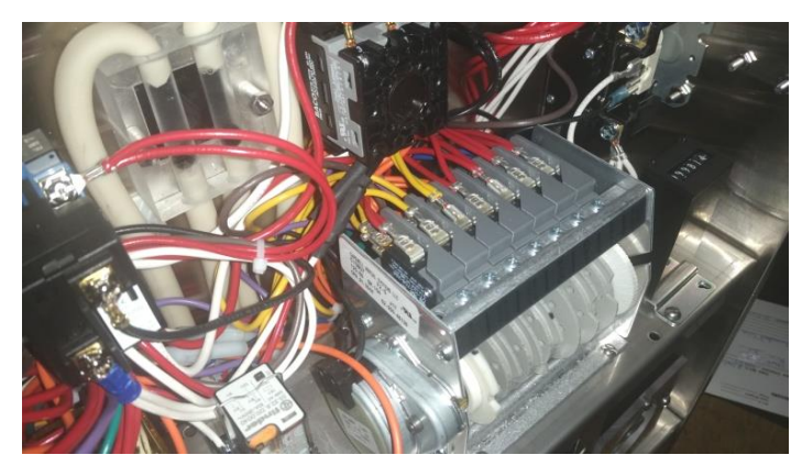
Relays, counter, switches, cam timer, motor contactor