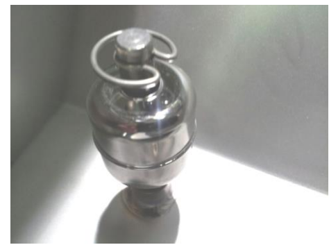
Control float, "O" mark should be on top

#4 CONTROL FLOAT—The control float is located inside the tank on the bottom to the right of the spray base, it prevents the machine from starting without sufficient water. Water flow issues will delay cycle until control float senses sufficient water in the tank. The float is secured on the float stem by a retaining clip. The stainless float has an "O" stamped on the end that should be on top. The glasswasher will not start if the float is installed upside down or missing.