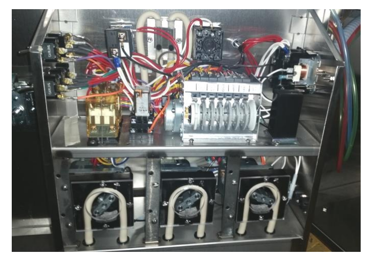
Showing deter, rinse, sanitizer internal chemical pumps

You must wear approved safety eye-wear before connecting chemicals. Read the chemical manufacturer's MSDS sheets. Chemicals can damage or corrode plumbing and stainless parts of the dishmachine. Do not run chemical lines over controls or plumbing. Always secure chemical lines and check regularly for leaks. If not properly handled, chemicals can cause serious bodily injury. In the event of chemical contact to skin or eyes; wash immediately with fresh water and seek medical attention.