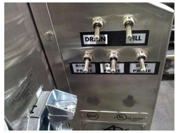
Showing controls on lower access door

A time cycle of 72-seconds is the timer available for this model and is compliant with NSF listing.