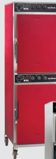
1000-SK-I shown with optional burgundy exterior †