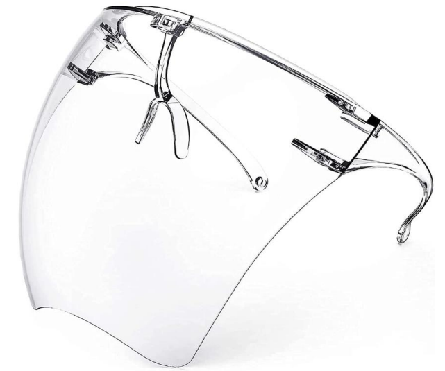
Face Shield Or Safety Glasses