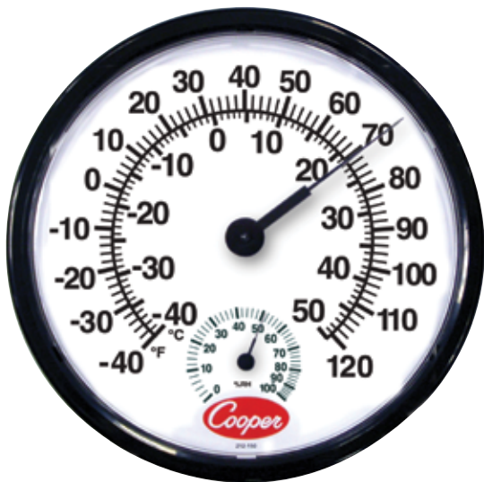
212-150 12" Wall Thermometer/Humidity Meter