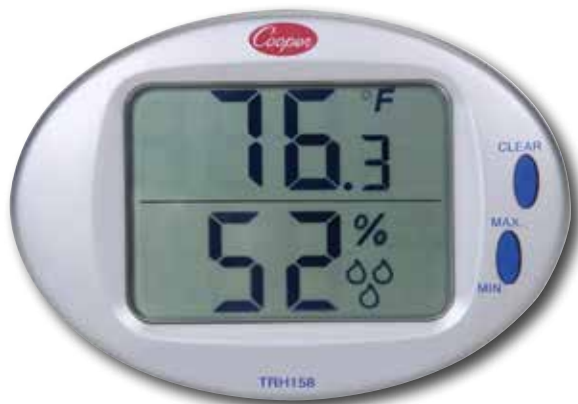
TRH158 Digital Temperature & Humidity Wall Thermometer

The TRH122M measures both temperature and % Relative Humidity. It features Min/Max memory and is °F/°C selectable.