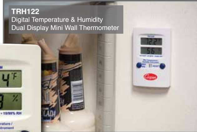
TRH122 Digital Temperature & Humidity Dual Display Mini Wall Thermometer

The TRH122M measures both temperature and % Relative Humidity. It features Min/Max memory and is °F/°C selectable.