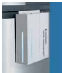
iAuCS (External Mounting)

Eliminates routine maintenance. iAuCS counts the number of ice-making cycles and, at a frequency you select, initiates a cleaning or sanitizing cycle... AUTOMATICALLY. Choose from 2-, 4-, or 12-week settings. Use with Indigo NXT modulars.