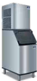
RNF0320 D-420 Bin