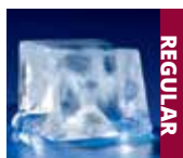
Available on UF0140 and UF0310