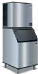
IT0750 D-570 Bin