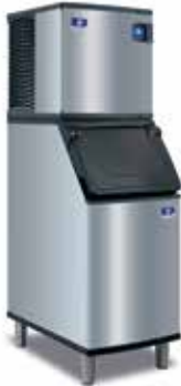
IT0620 D-420 Bin