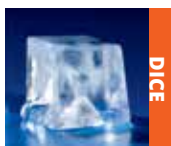
Available on all undercounters