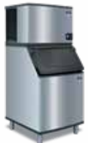
IF0600 D-570 Bin