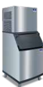
RNF1100 D-570 Bin