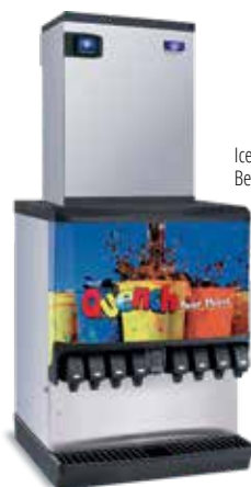
Ice/Beverage Series on Beverage Dispenser