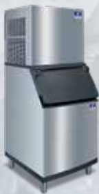
RFF0320 D-420 Bin