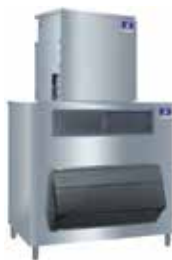
RFF2200C F-1650 Bin