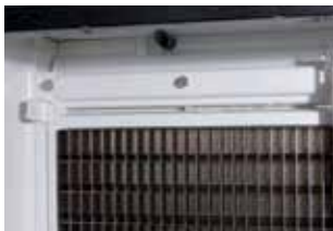
Ice machine equipped with LuminIce II