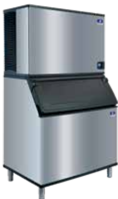
IT1900 D-970 Bin