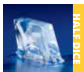
Available on all undercounters

These compact ice cube machines are ideal for small-volume ice production, for limited use needs, or as back-ups for larger machines. Specifically designed to fit beneath counters or in areas where floor space or height restrictions prohibit use of larger equipment. The petite size makes any of these models ideal for on-the-spot installations at coffee shops, stadium boxes, refreshment/break areas, or wherever limited ice needs require equipment with a small footprint.