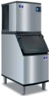
IT0420 D-320 Bin