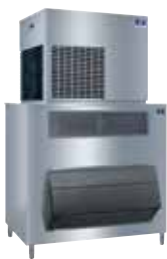
RFF2500 F-1650 Bin