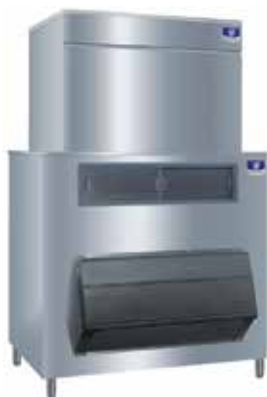
SF/ST 3000 F-1650 Bin