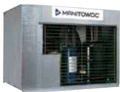
CVD Condensing Unit***