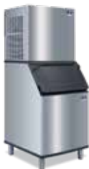
RFF1220C D-420 Bin