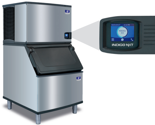
Indigo NXT Series iT0450 Ice Machine on D400 Bin

Designed for operators who know that ice is critical to their business, the Indigo NXT Series ice machine's preventative diagnostics continually monitor itself for reliable ice production. Improvements in cleanability and programmability make your ice machine easy to own and less expensive to operate.