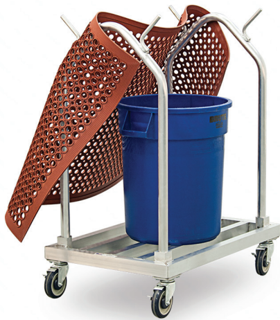
51087 | Mat Cart (Knocked Down)