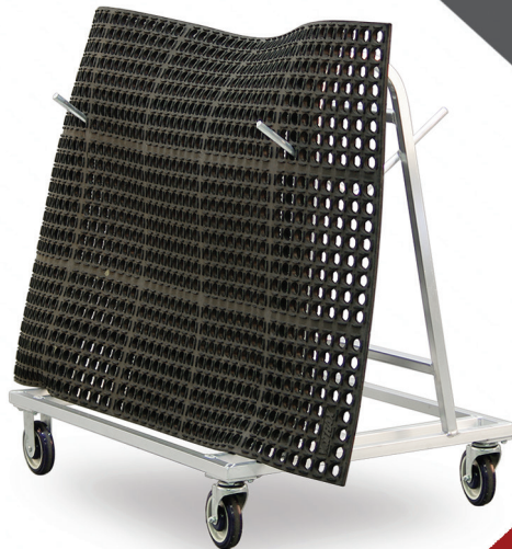
99360 | Mat Cart (All Welded)

Labor saving mat rack and carts keep mats off of the floor for easy, efficient cleaning.