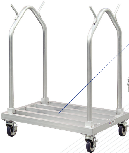
99360 | Mat Cart (All Welded)

open design allows use of waste container.