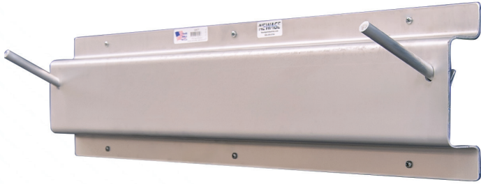
52677 | Wall Mount Mat Rack