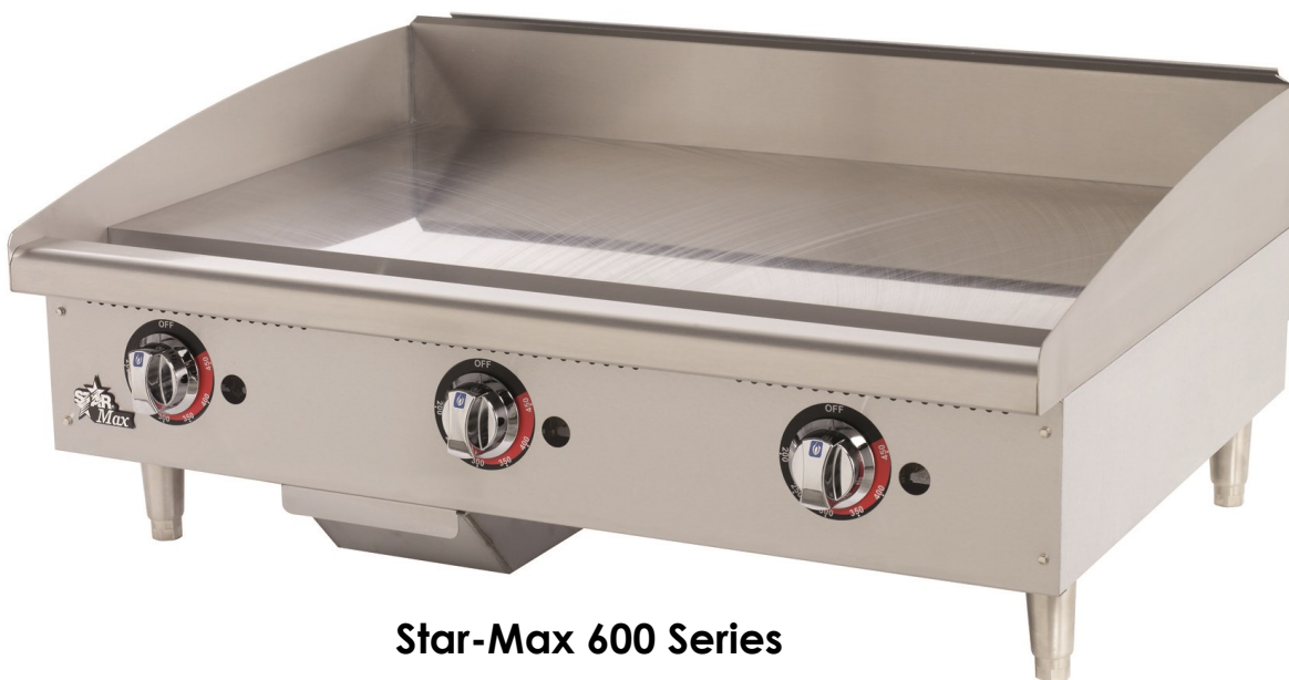
Star-Max 600 Series Snap-Action Griddles

Available in 15", 24", 36" and 48" widths.