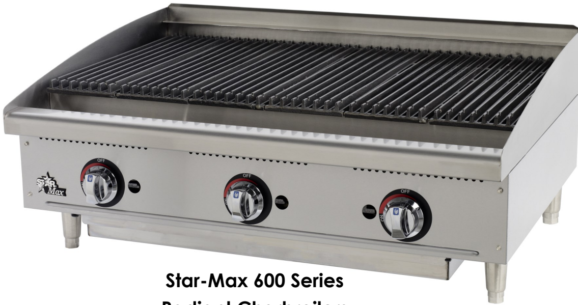
Star-Max 600 Series Radiant Charbroilers

STAR-MAX Radiant Gas Charbroilers are designed and built here in the U.S.A. to deliver exceptional performance, consistent and reliable results year after year. Available in 15", 24", 36" and 48" widths.