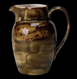
0283 3 Decanter 0.6 litre (1 pint)