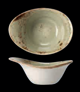
0524 FreeStyle Bowl 7" (14 ½ oz) 0525 FreeStyle Bowl 5" (4 oz)