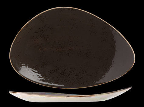
11540501 FreeStyle Plate 145/8"