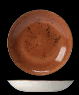
0569 Coupe Bowl 10" (38 oz) 0570 Coupe Bowl 8 ½" (27 oz) 0571 Coupe Bowl 5" (4 oz)