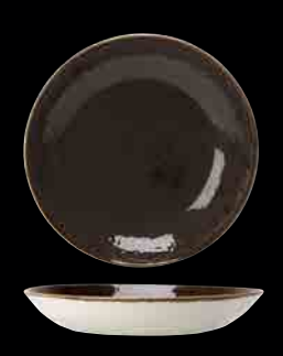
11540569 Coupe Bowl 10" (38 oz) 11540570 Coupe Bowl 8 ½" (27 oz) 11540571 Coupe Bowl 5" (4 oz)