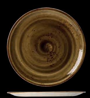
0565 Coupe Plate 11¾" 0566 Coupe Plate 10" 0567 Coupe Plate 8" 0568 Coupe Plate 6"