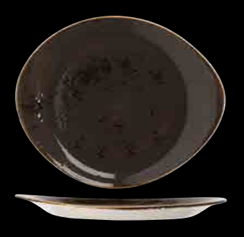
11540520 FreeStyle Plate 12" 11540521 FreeStyle Plate 10" 11540522 FreeStyle Plate 6"