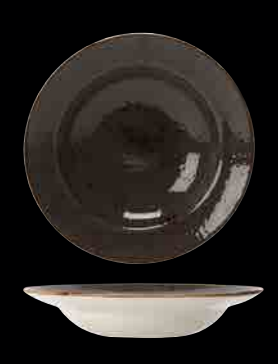
11540372 Nouveau Bowl 10 ¾" (15 oz)