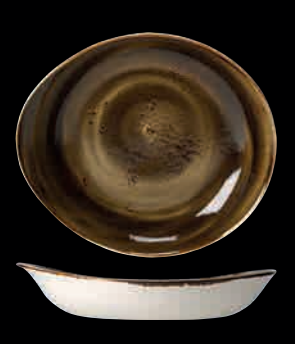
0523 FreeStyle Bowl 11" (32 oz)