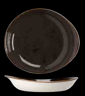
11540523 FreeStyle Bowl 11" (32 oz)