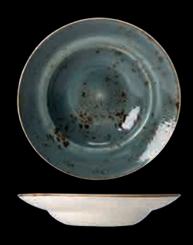
0372 Nouveau Bowl 10 ¾" (15 oz)