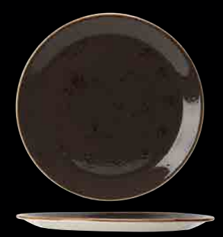
11540565 Coupe Plate 1134" 11540566 Coupe Plate 10" 11540567 Coupe Plate 8" 11540568 Coupe Plate 6"