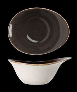
11540524 FreeStyle Bowl 7" (14 ½ oz) 11540525 FreeStyle Bowl 5" (4 oz)