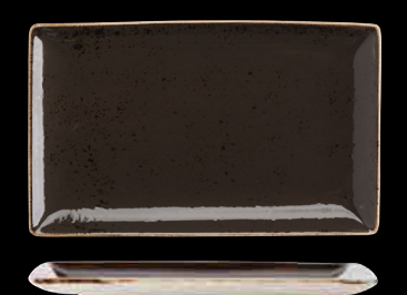
11540550 Rectangle One 10 % x 6 % 11540551 Rectangle Two 13 % x 10 % 11540556 Rectangle Three 13 % x 7 % 11540552 Rectangle Four 14 % x 6 % 11540553 Square One 10 %