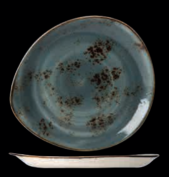
0520FreeStyle Plate12"0521FreeStyle Plate10"0522FreeStyle Plate6"