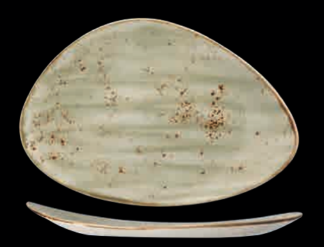
0501 FreeStyle Plate 145%"