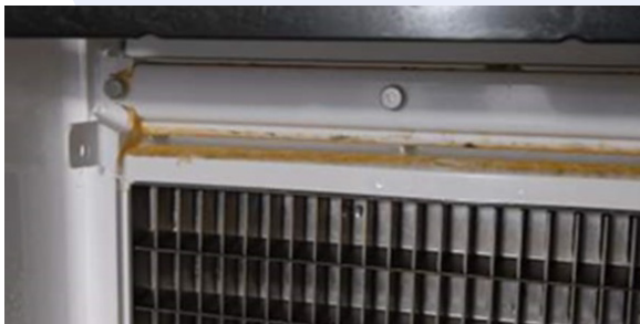
75 days without LuminIce® II

Because LuminIce® II works 24/7, your machine is continually guarded, whether it is making ice or not . The Indigo® NXT displays a blue sanitation icon in the display frame to let you know it's working, and changes to red when it's time to change the bulb.