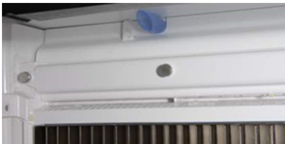
75 days with LuminIce® II