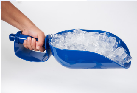
Standard Ice Scoop Item # 0000015595