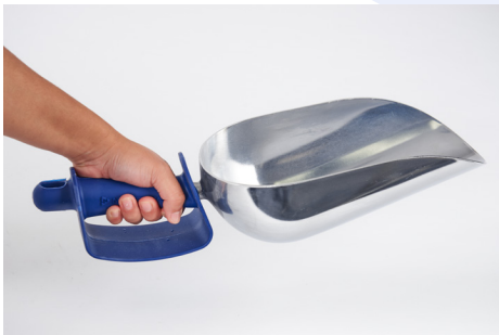
Optional NSF-Approved Metal Scoop with Lifetime Guarantee Item # K00463